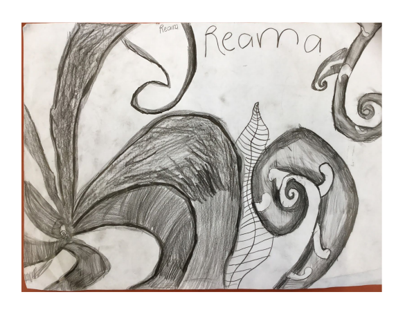
Reama has used shading in her koru and is using other different patterns to make her work more interesting.