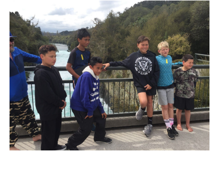
The boys at Huka Falls