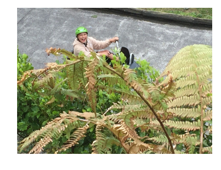
Kani breaking the land speed record.