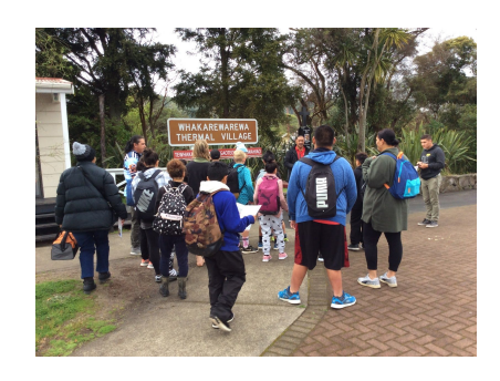
Early morning tour