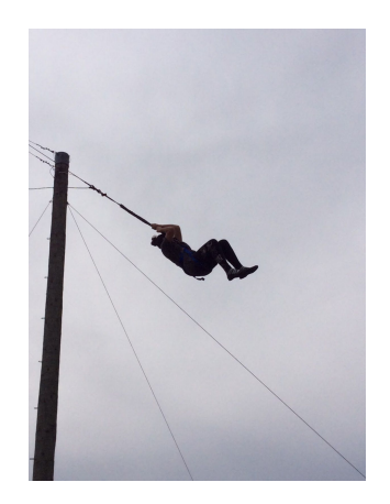
Carmel swing in the breeze