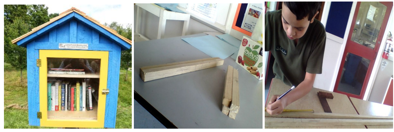
Herbie and Danny's design will hopefully end up looking similar to the 1st picture.